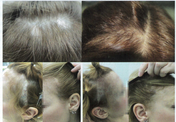
FIGURE 1. Scalp scars treated with fat and hair grafting.

opposed to the challenges of harvesting stem cells from bone marrow. 2 Stem cells have shown at least some efficacy for the treatment of pattern baldness. Second, the tissue possesses anti-androgen activity, androgens being an element in the progression of male pattern hair loss (MPHL) and possibly female pattern hair loss (FPHL). 3 Third, adipose tissue possesses anti-inflammatory properties. Inflammation is associated with, if not a contributing factor to, pattern baldness, with mild perifollicular fibrosis and infiltrates found in some patients with androgenetic alopecia. 4 Adipose-derived stem cells may prevent further inflammation and possible damage to hair follicles through enhancement of anti-oxidative and anti-inflammatory mechanisms. Fourth, as described above, adipose tissue induces neovascularization, and can potentially thicken the subcutaneous layer that typically is associated with thinning in androgenetic alopecia. 5